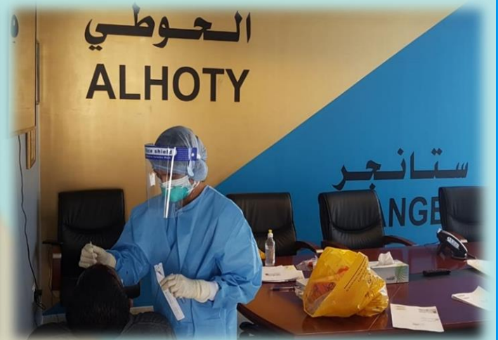
RAKEZ organizes free-COVID tests for all our staff in RAK.