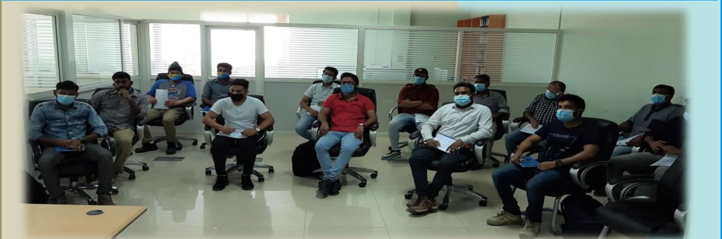
Training of radiation safety, operation and maintenance of nuclear density gauge @ AD.