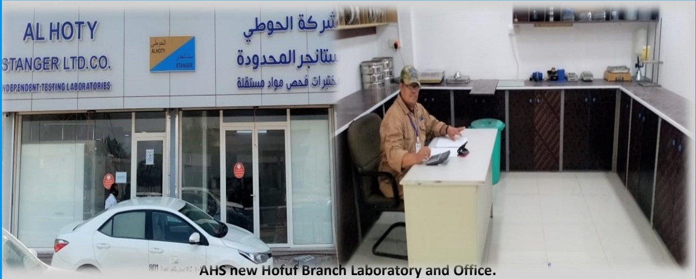
AHS new Hofuf Branch Laboratory and Office.