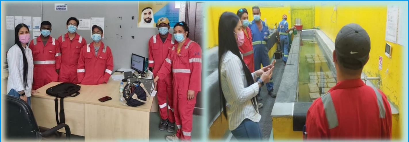
Site Lab audit by external client's auditor - AD.