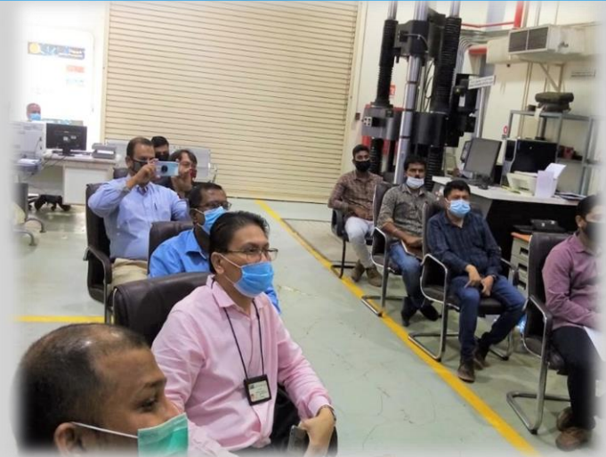
Ethical Improvement Awareness Session hosted by Saudi Aramco for NDT personnel.