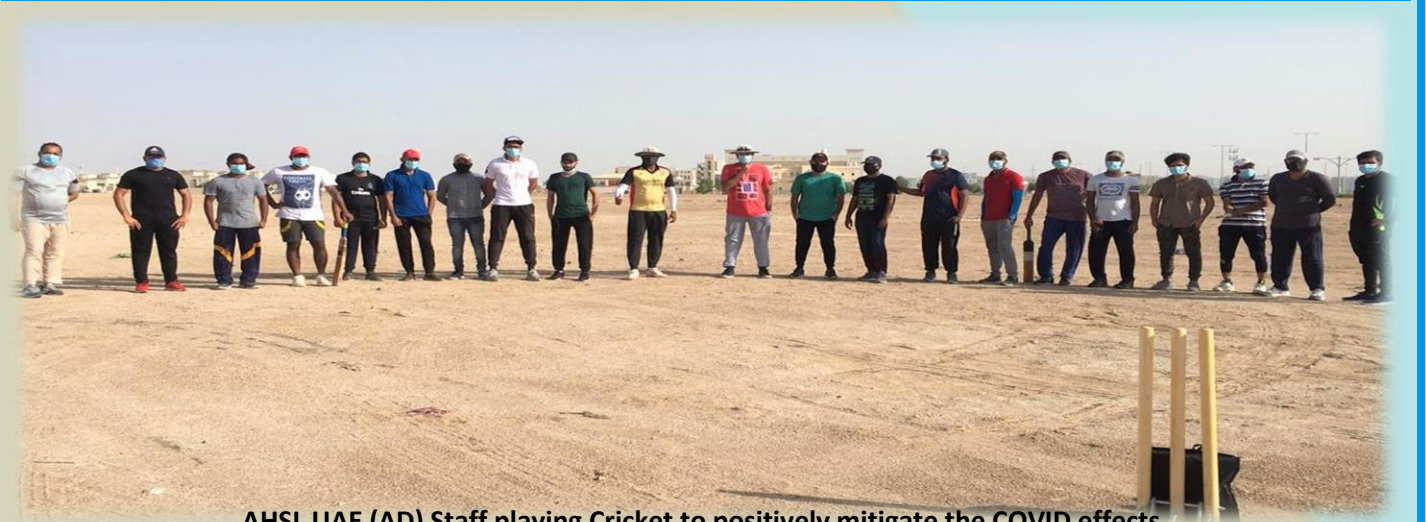
AHSL UAE (AD) Staff playing Cricket to positively mitigate the COVID effects.