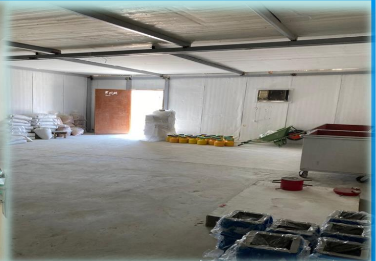
New Successful Site lab set up in Abu Dhabi.