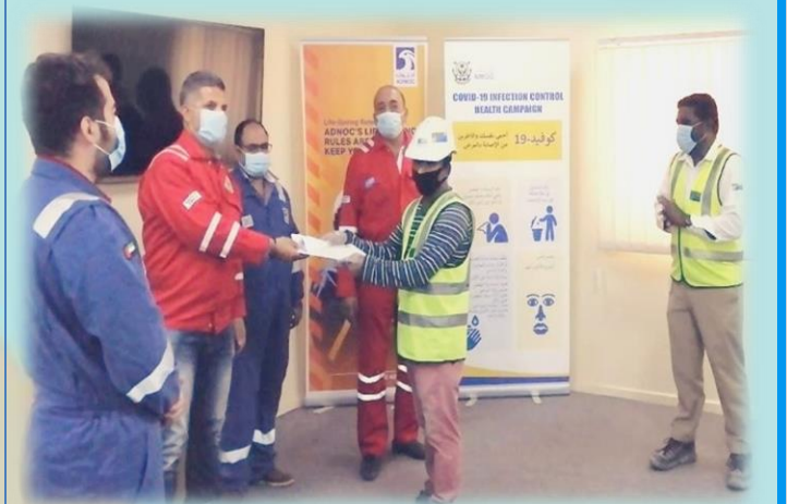
ADNOC appreciates our Staff for conforming to HSE requirements at our site lab in RAK.