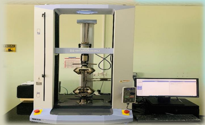
AHSL AD's new addition to our testing arsenal, UTM from Shimadzu (Japan) for testing compression, peel, shear of various materials .