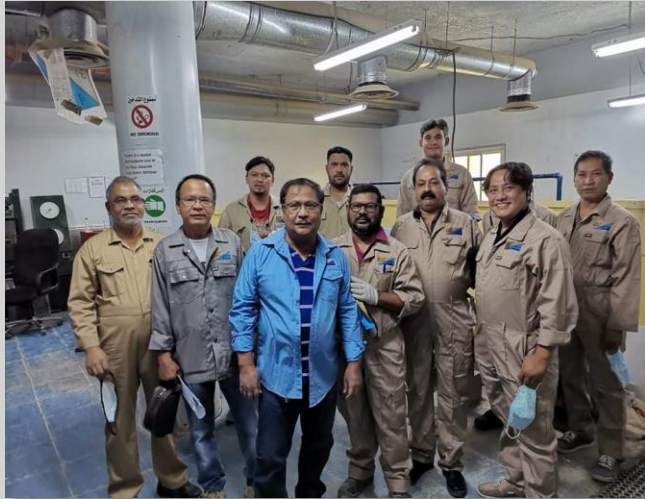
AHS-Riyadh team for their excellent performance during Eiac ISO 17025 audit.