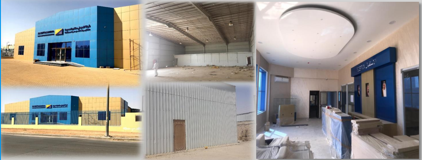
The New AHSL-Riyadh Lab, Another AHSL Phoenix rises in the KSA Kingdom – Congratulations to all involved.