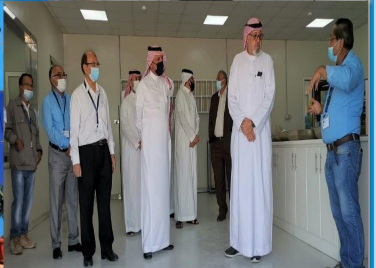
AHS Riyadh opens its New Office and Laboratory.