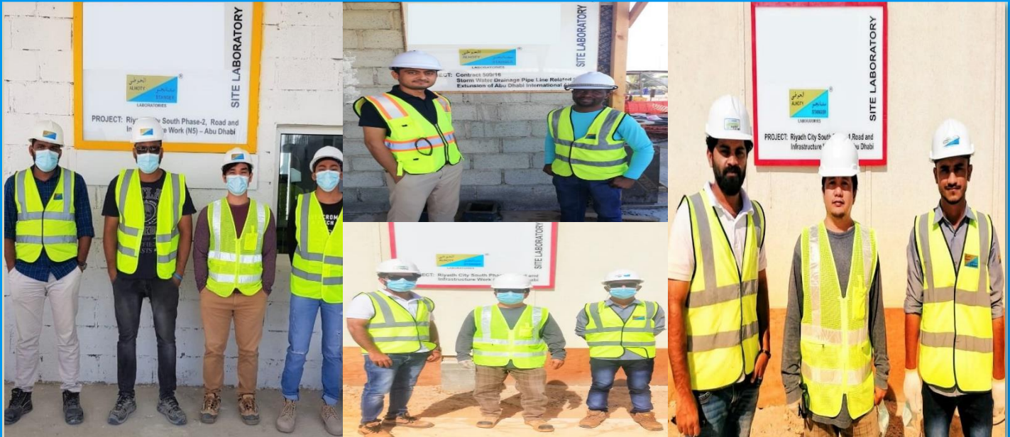
AHSL UAE Launches 4 New Site labs in AD.