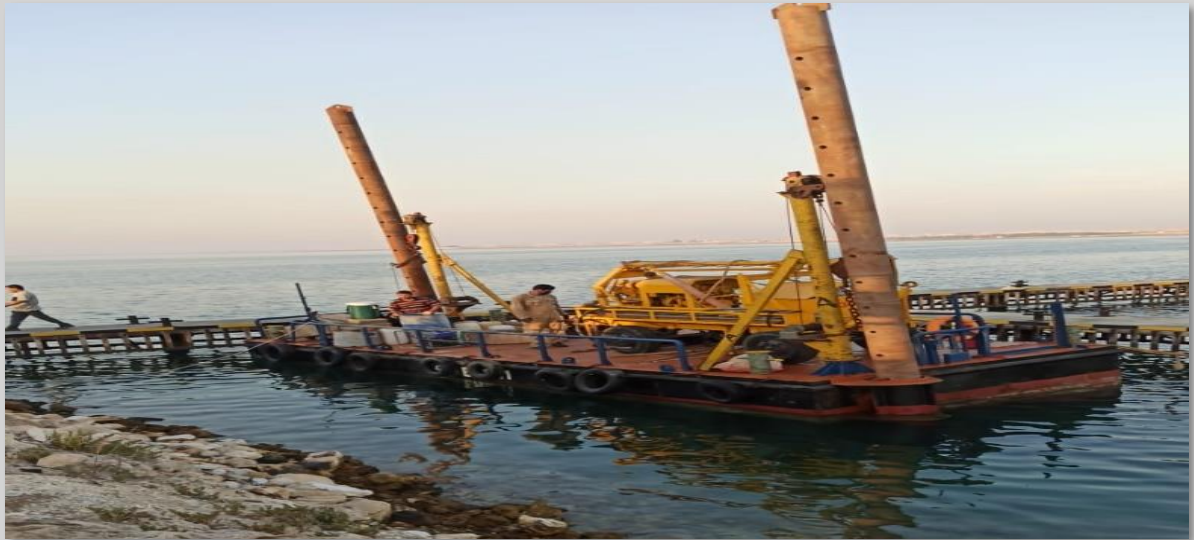
AHSL-ILS (Bahrain) completes a prestigious OFF Shore drilling project.