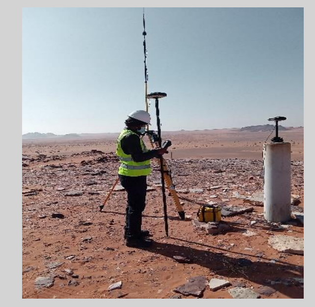
Set up of GPS Base on NEOM site Bench Mark-1 (KSA)