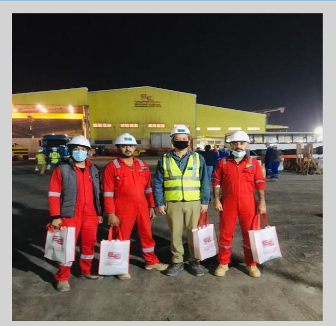
AHSL staff doing the night shift at the Concreting Plant in Abu Dhabi