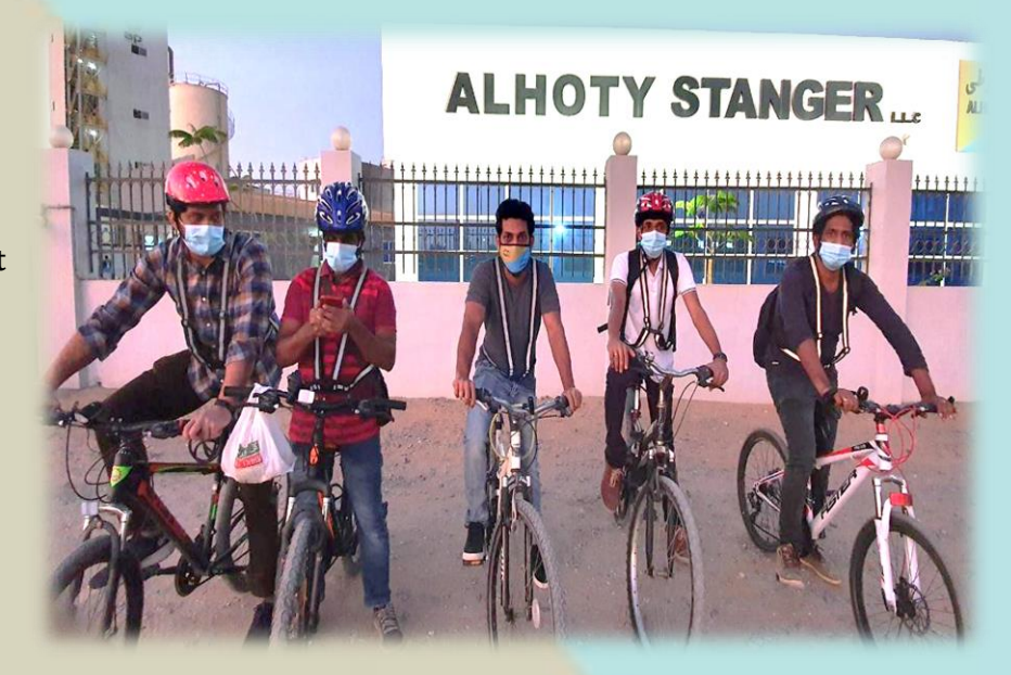
RAK Team departs for their accommodation after a late night shift on New Year's eve.

AHSL DGM training a group of Engineers on the nuances of Water Microbiology in Abu Dhabi