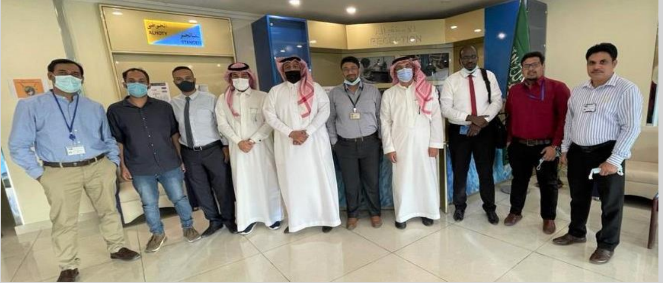
Successful Saudi Accreditation Committee (SAC) audit at AHS Jubail Branch.