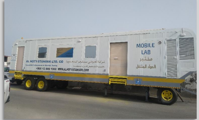
AHSL-KSA now sets up a mobile lab at NEOM-KSA.