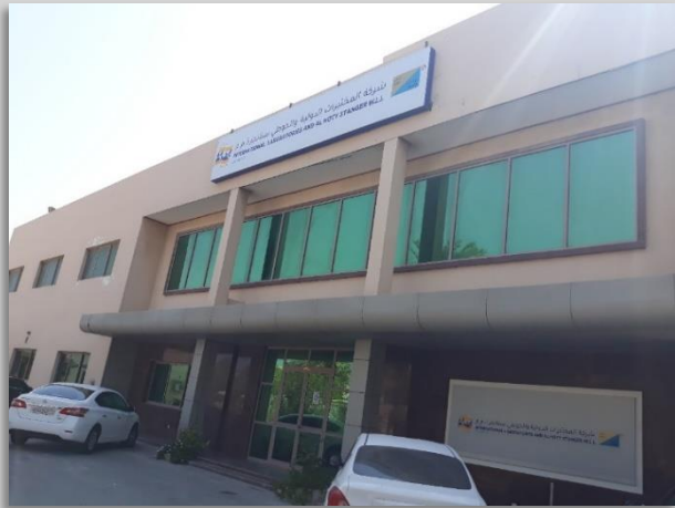
Our Laboratory in Bahrain's official name is International Laboratories- Al Hoty Stanger W.L.L.