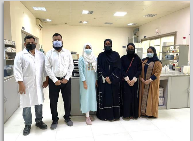
Chemical Engineers from University of Bahrain completed their Training at International Laboratories-Al Hoty Stanger W.L.L.