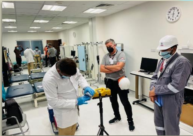
Indoor Air Quality Tests in progress at a reputed Hospital in Abu Dhabi.