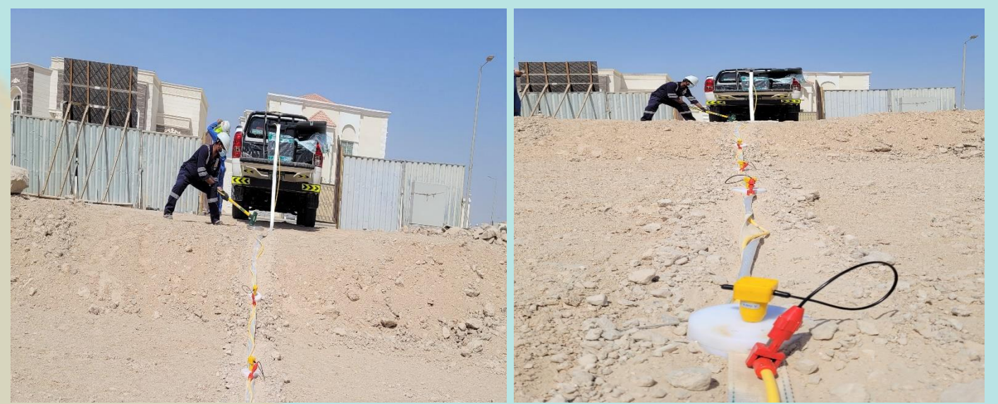
AHSL UAE launches its new GEO-PHYSICAL TEST SCOPE, as part of its current repertoire of Geo-tech tests.