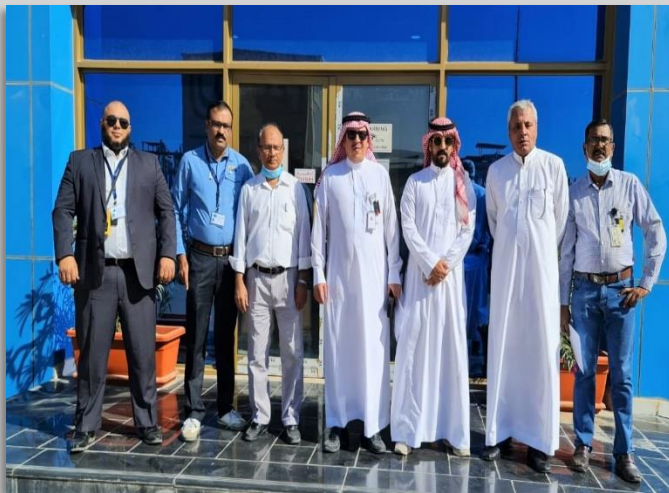
Successful Audit of Nuclear and Radiological Regulatory Commission (NRRC) at Riyadh Branch radiation source pit.