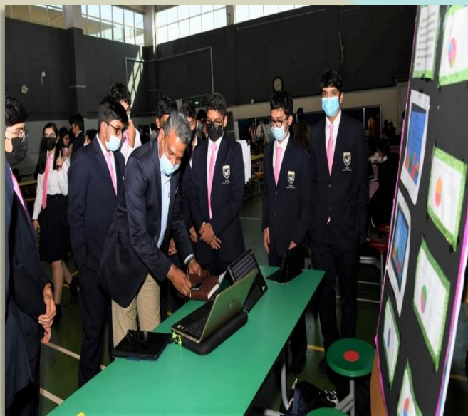
AHSL DGM visits at school as part of a judging panel for new Innovations in Science.