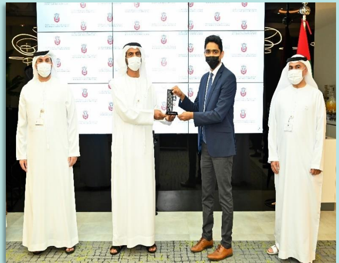
AHSL-UAE-Micro dept. participation at Dubai International Food Conference at EXPO 2020.