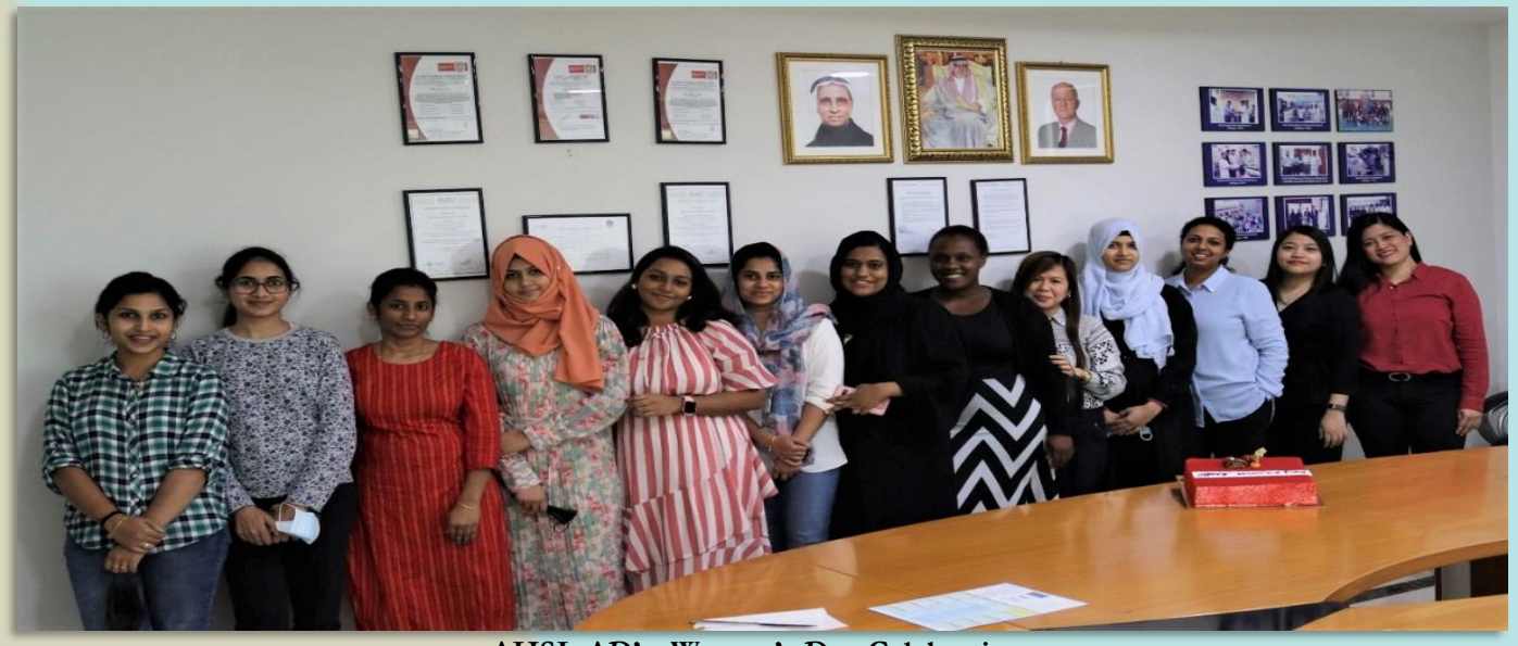
AHSL-AD's, Women's Day Celebration.