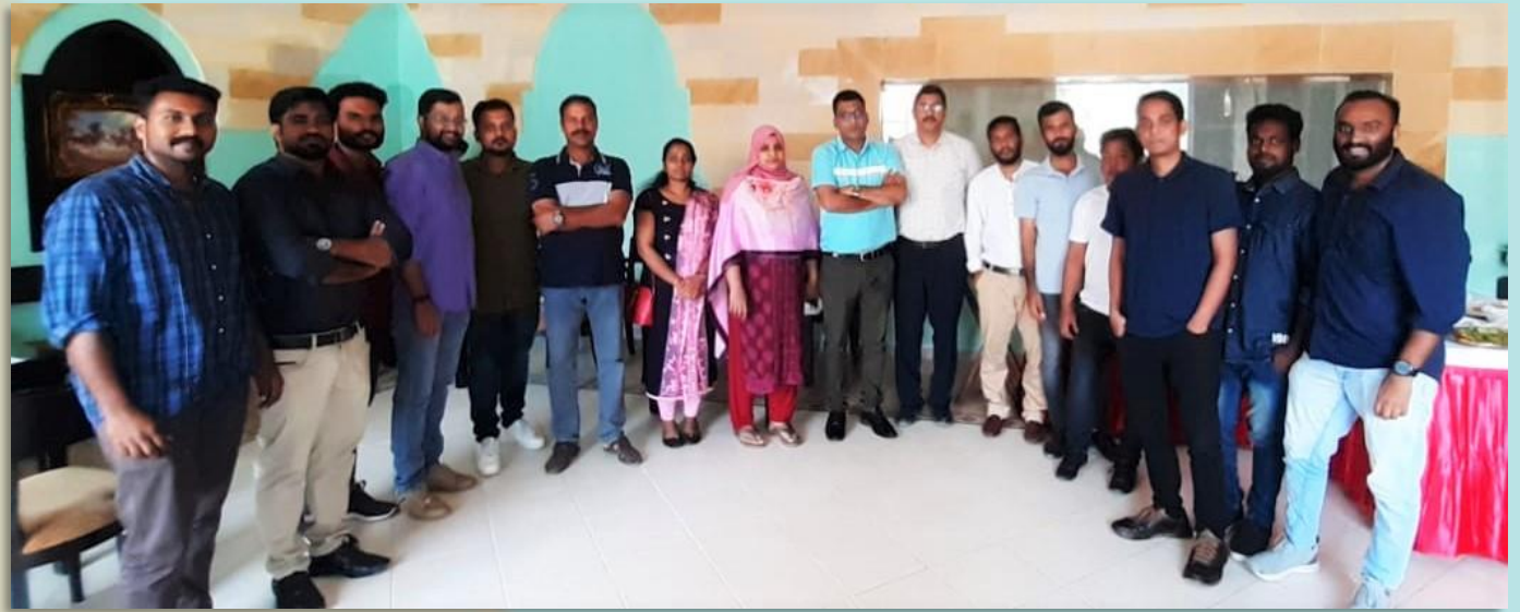
AHSL UAE- Kalba Team get together celebrating an excellent sales performance month.