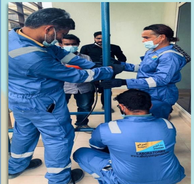
Special Balustrade load testing by AHSL-AD Team at a premium Residence complex in Abu Dhabi.