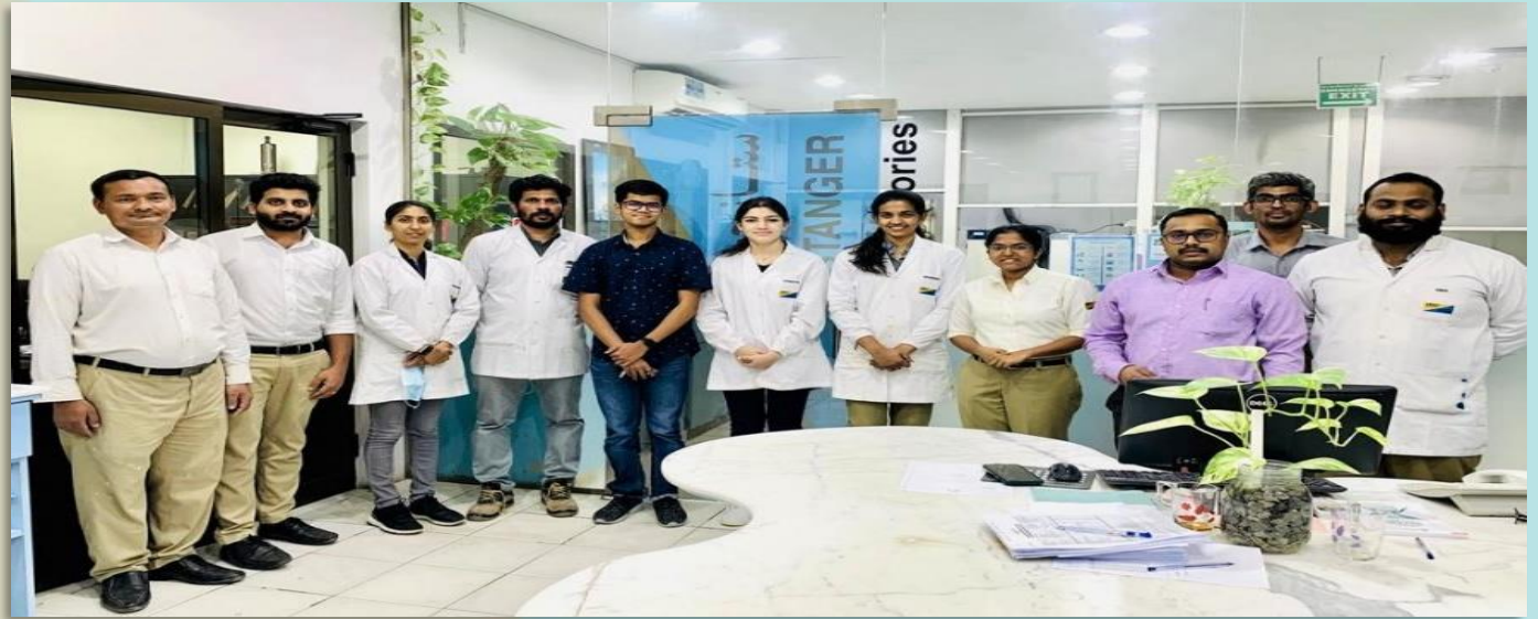
Two Student Trainees from Dubai College at AHSL-DXB lab.