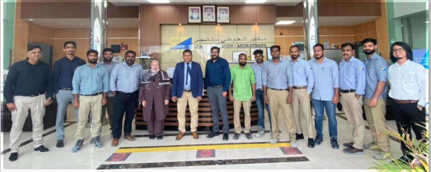
Successful ENAS-Abu Dhabi Scope Extension audit completion.