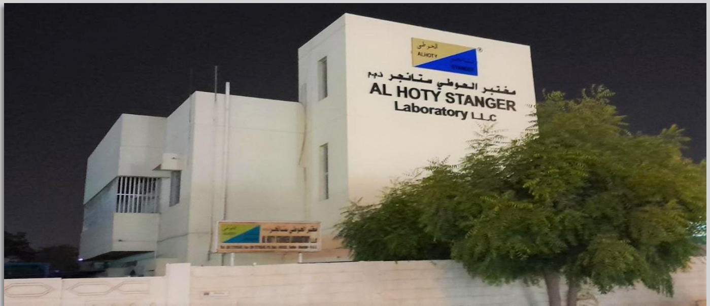
New Billboard of AHSL-KALBA lab.