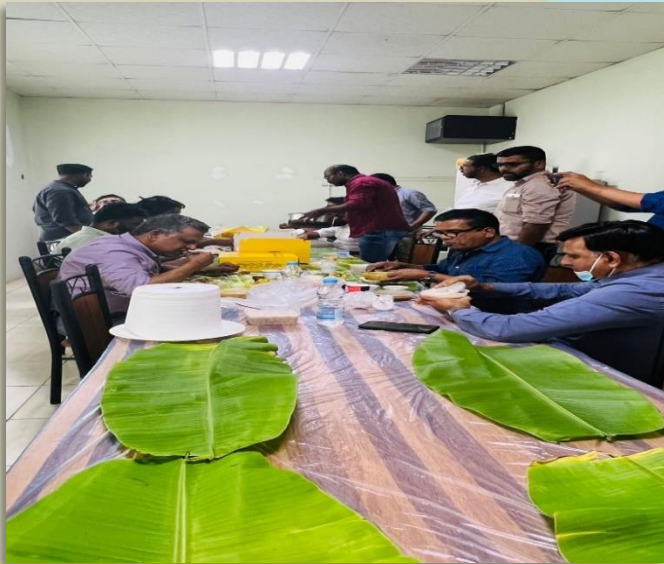
RAS AL KHAIMAH