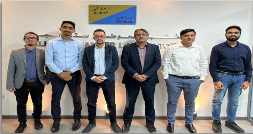
Completion of AHSL UAE ISO 9001, 14001, 45001 audit certifications-AUH.