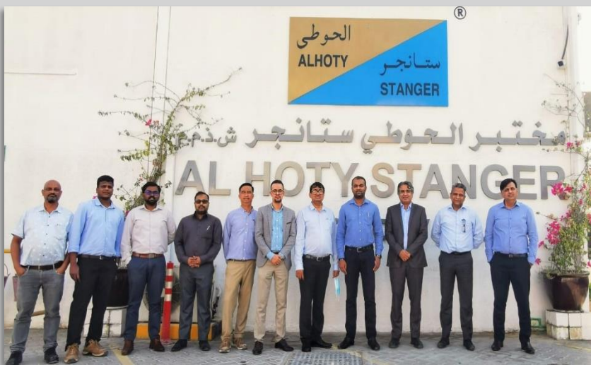
Completion of AHSL UAE ISO 9001 audit certifications-DXB.