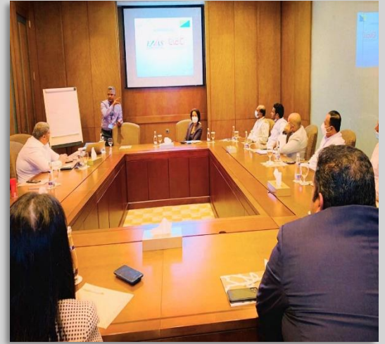
AHSL-DGM visits an important client to explain the nuances of testing.