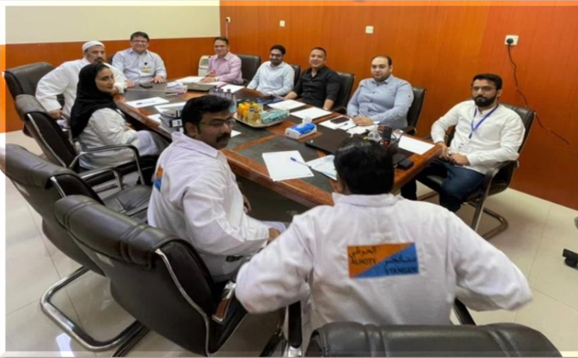
Opening meeting for a project in Bahrain at KSA main lab.