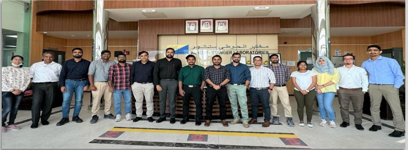
The "young" Internal QA Auditors on Team AHSL UAE now.