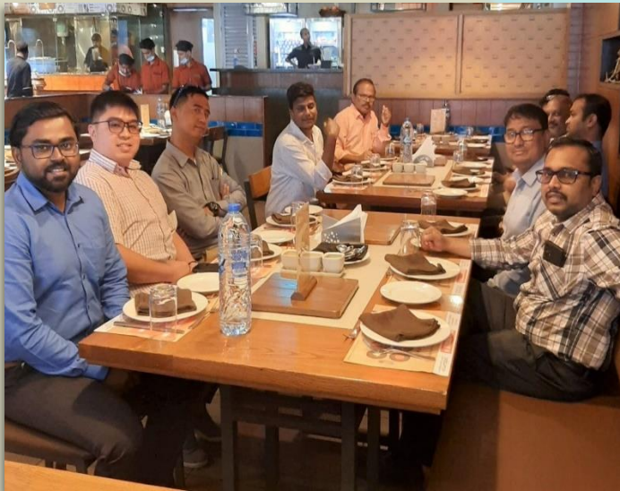
DXB-HOD's Lunch meeting at a Restaurant in Dubai.