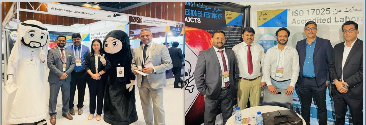
A very successful presentation at the DIFSC (Dubai International Food Conference) from AHSL-UAE.