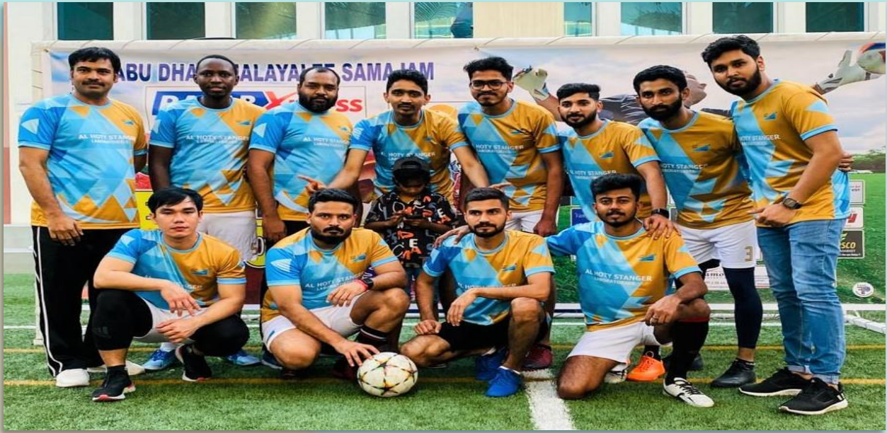
Team AHSL ABU DHABI pick up the Penalty Shoot-out Cup from 30 participating teams in AD.