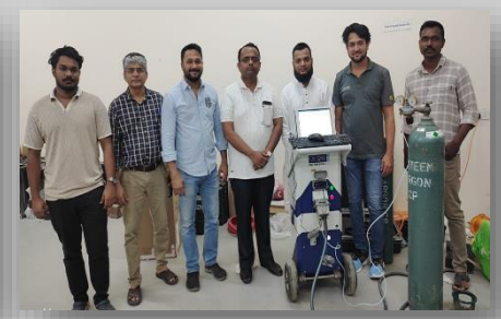
PMI training by Hitachi Germany under the supervision of AHS-KSA Technical Manager