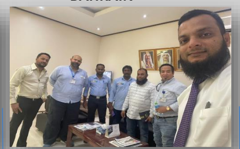
Calibration training at AHS-Bahrain