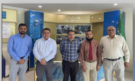
AHS KSA Higher Management visited AHS Jubail with delegation from Bahrain for feasibility studies.