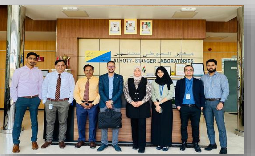
Successful BV audit – Abu Dhabi Lab