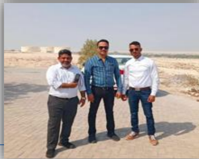
ILS-AHS Team members from various departments meeting customers on site.