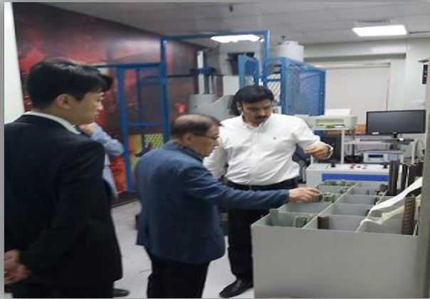
Client visit, Abu Dhabi